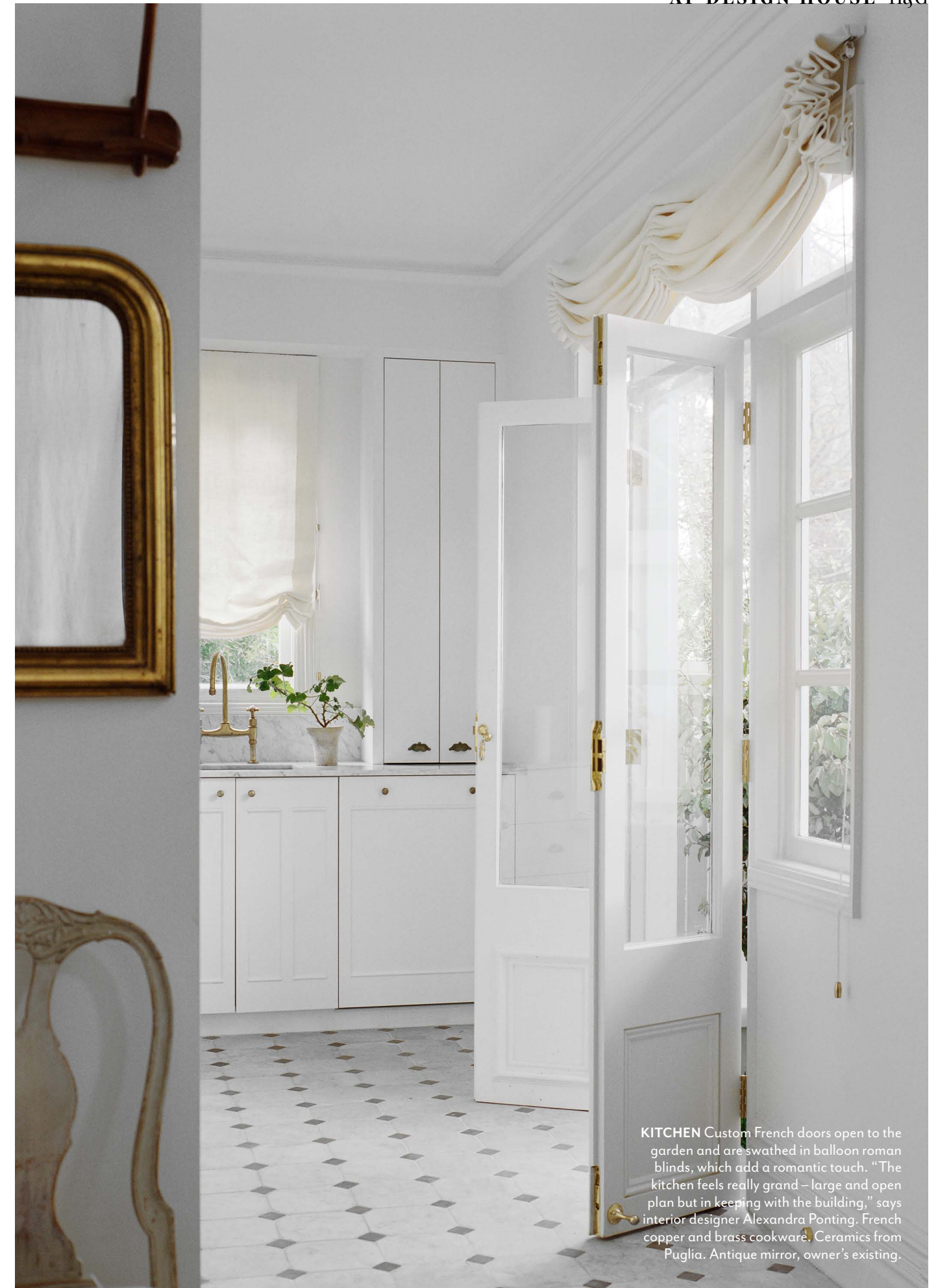
KITCHEN Custom French doors open to the garden and are swathed in balloon roman blinds, which add a romantic touch. "The kitchen feels really grand - large and open plan but in keeping with the building," says interior designer Alexandra Ponting. French copper and brass cookware. Ceramics from Puglia. Antique mirror, owner's existing.

"I ADORE HAVING A BEAUTIFULLY NATURAL SPACE - IT REALLY GROUNDS ME." Zoë, owner